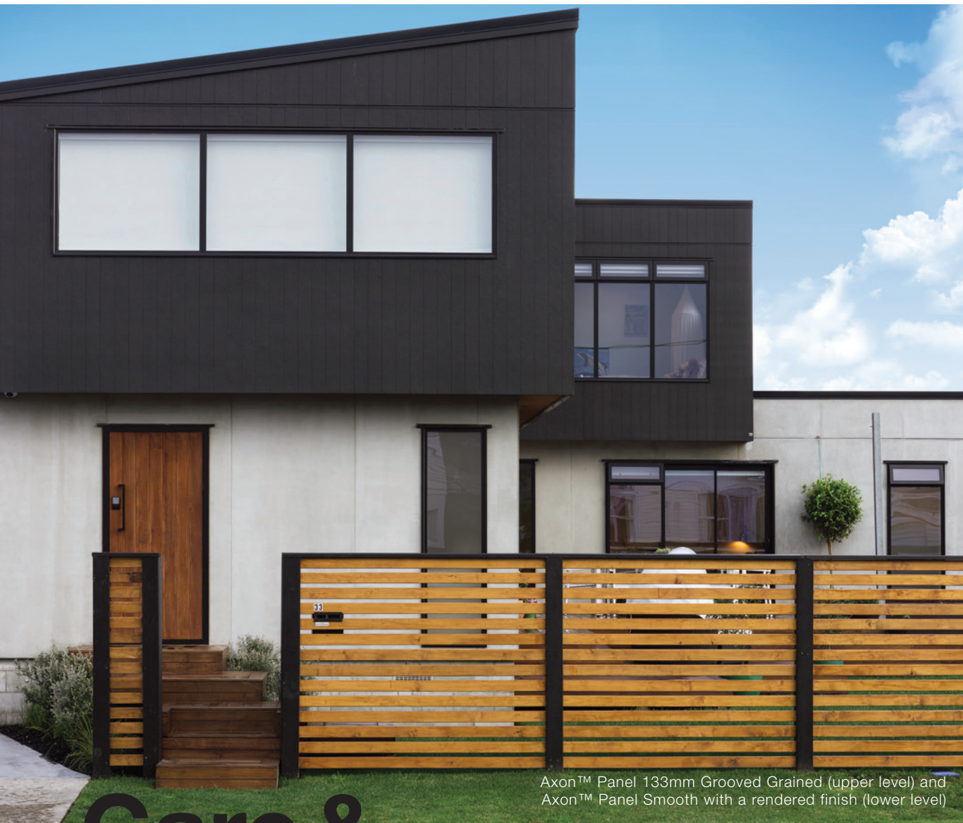
Axon™ Panel 133mm Grooved Grained (upper level) and Axon™ Panel Smooth with a rendered finish (lower level)