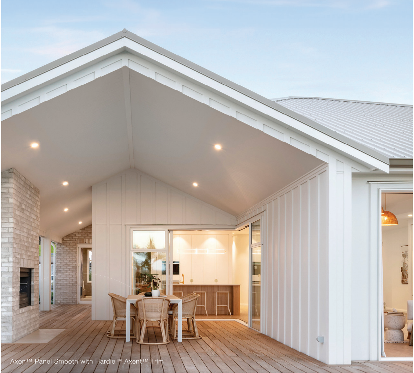
Axon™ Panel Smooth with Hardie™ Axent™ Trim