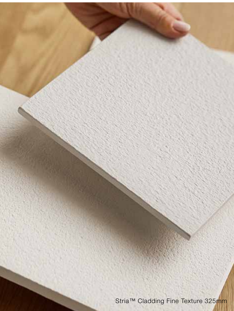
Stria™ Cladding Fine Texture 325mm