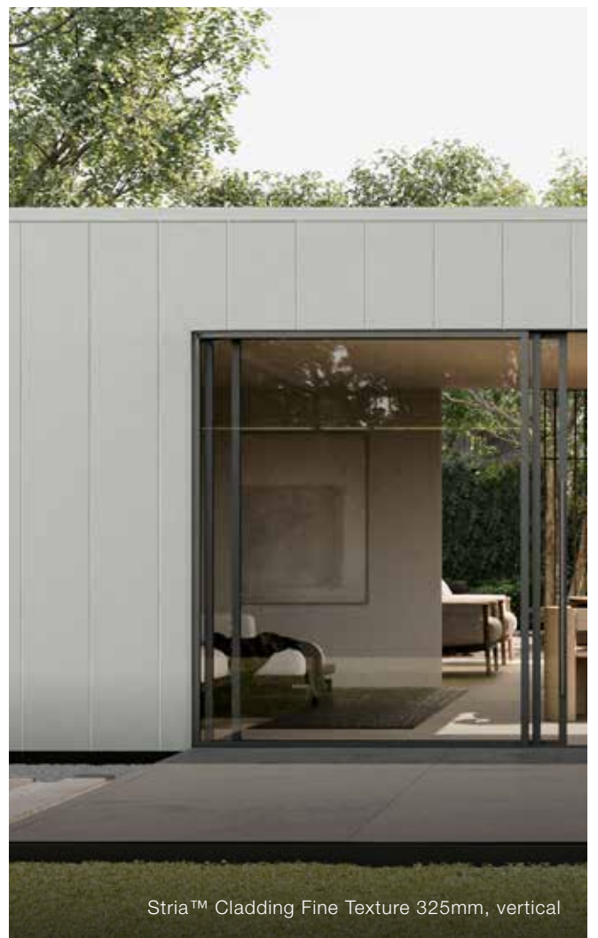
Stria™ Cladding Fine Texture 325mm, vertical