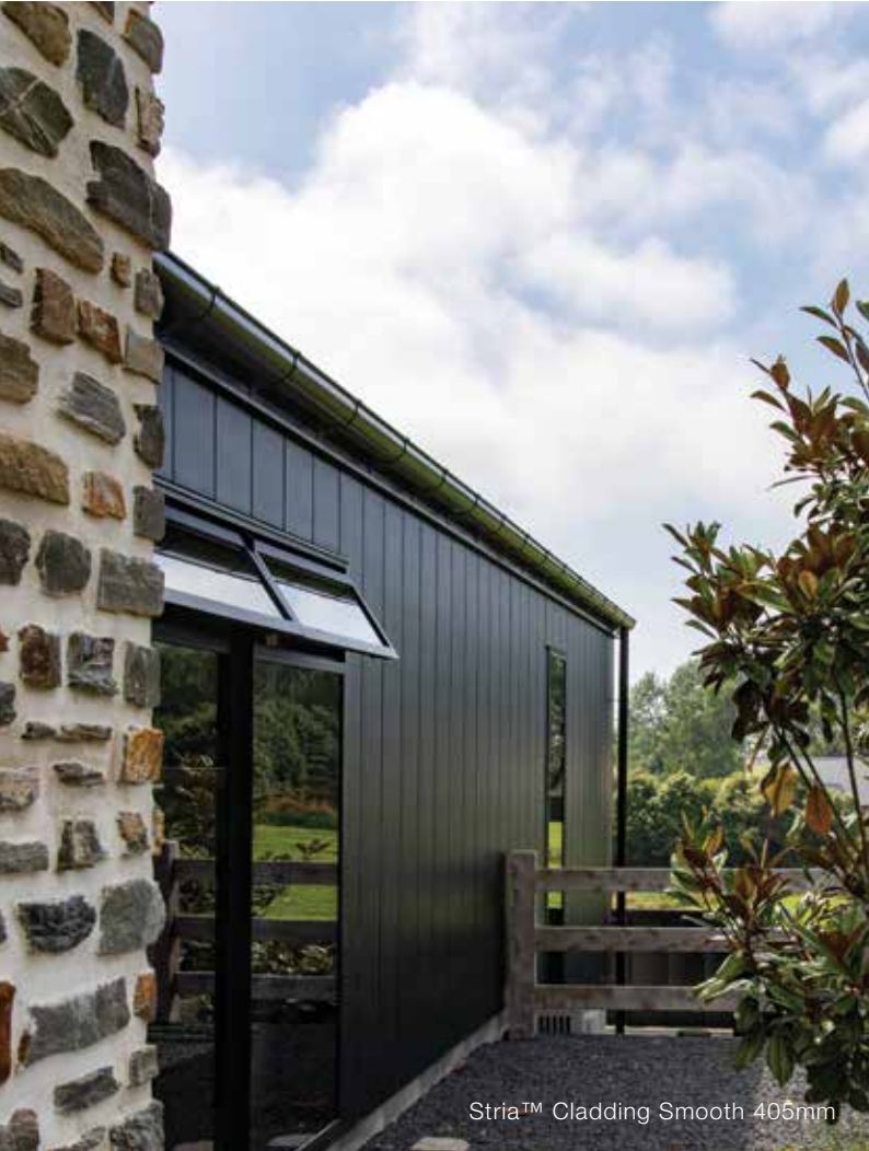
Stria™ Cladding Smooth 405mm