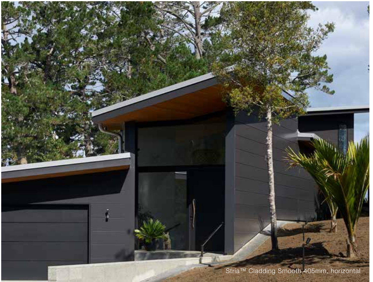
Stria™ Cladding Smooth 405mm, horizontal