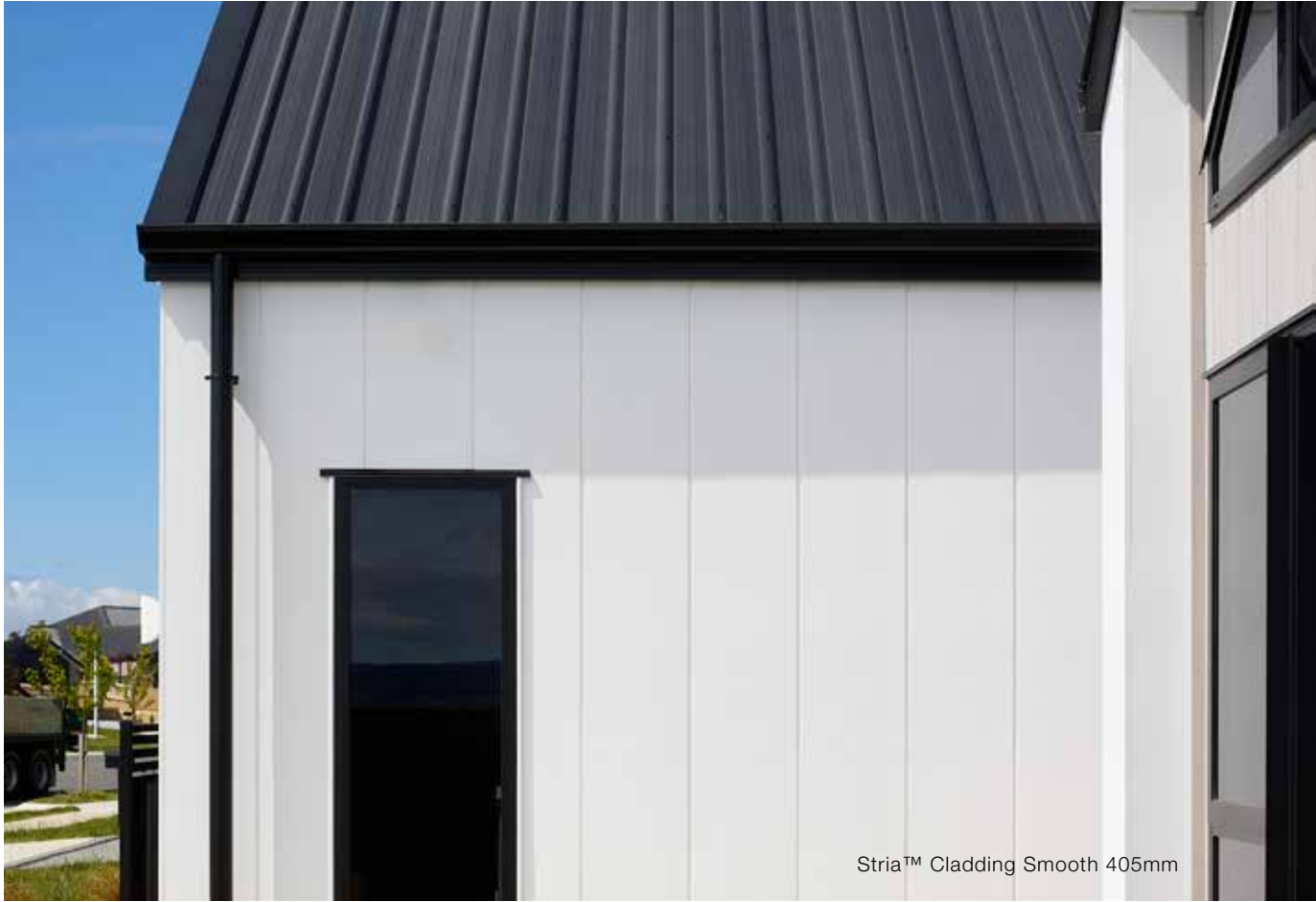
Stria™ Cladding Smooth 405mm